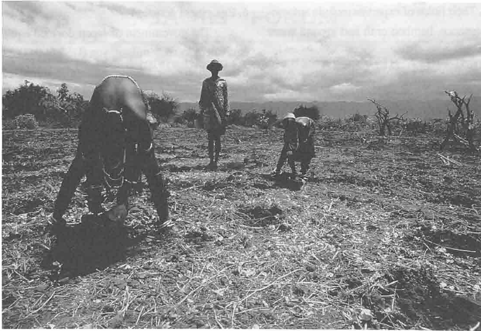
Harvest in an experimental field, southwestern Ethiopia

well construction will be provided to provide safe water supply in various areas in the country. A grant agreement for 697 million yen was signed on June 15, 1993.